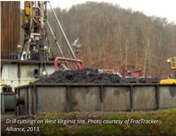
Drill cuttings on West Virginia site.