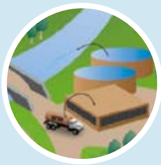
Wastewater Treatment Plants

Some wastewater treatment plants treat SGD liquid waste and release the treated water into surface water. When liquid waste is cleaned, the toxics in the leftover by-products will be more concentrated. Any solid or liquid by-products of the wastewater treatment process are sent to landfills or injected into Class II injection wells.