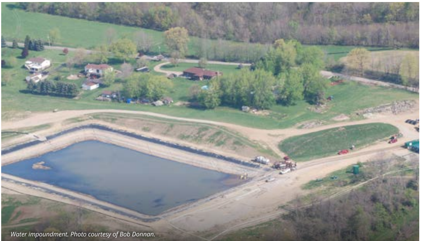
Water impoundment.

As radium-226 decays, it produces radon , a radioactive element that can cause harm to the body when inhaled. While radon has a much shorter half-life than radium, it can travel through air, settle on surface water, seep into groundwater, and collect in basements. Evaporation of leachate from shale gas sites or landfills can enable the release of radon into the atmosphere. The EPA considers radon to be a human carcinogen, indicating that the more exposure someone has to radon, the higher the chance they will develop cancer. Radon is the second leading cause of lung cancer in the U.S., estimated to be responsible for 20,000 lung cancer deaths every year. 5