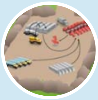
Recycled Liquid Waste

Some SGD liquid waste is recycled and used in other wells. To be usable, the waste must first be treated. The treatment process can complicate the tracking of liquid waste from cradle to grave. The recycled fluids are stored in tanks, impoundments, or containment pools and are trucked or piped to locations to be reused. Each time liquid waste is recycled, the toxics in the leftover by-products will be more concentrated. Any solid or liquid by-products of the recycling treatment process are sent to landfills or injected into Class II injection wells.