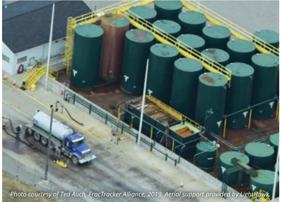
Photo courtesy of Ted Auch, FracTracker Alliance, 2019. Aerial support provided by LightHawk.